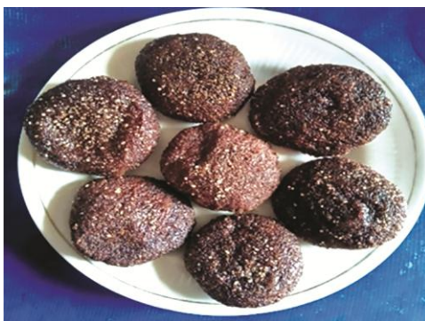
Fig. 7 — Sitao

Awang bleb is another variety of rice cake from the state of Tripura. This rice cake is similar to the Sachao of Manipur and the Sitao of Assam. It is one of the most popular types of rice cake consumed during gatherings and many festivals. It is made of Auwan/Gurian Maira (375 g), Bengal Joha (125 g), jaggery/sugar (10 g), salt (2 g) and sesame seeds (2 g). The preparation method is similar to that of Awang bangui . After mixing the two varieties of rice, melted jaggery, sugar, salt, and sesame seeds were added. The dough is made into a small flat circular disc and deepfried (80-90°C) for 5 min on each side till a golden brown colour is achieved.