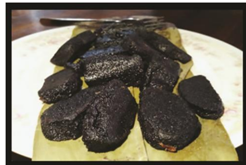
Fig. 6 — Sachao

The rice cake, Awang bangui , is traditionally made in the state of Tripura, mainly by the Tripuri. Two varieties of rice are used for the making of this rice cake. Auwan/Guria Maira (local sticky rice) at 75% and Bengal Joha rice at 25% are taken and mixed together. The rice is soaked for 3-4 h. Following that,