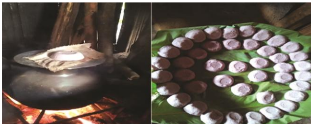
Fig. 3 — Pumaloi

Pumaloi is a smaller version of Pusyep . It is smaller in size, whereas Pusyep is bigger. The method of preparation is the same as for Pusyep . The rice flour (5 g) is put in a small round steel bowl measuring 5 cm in diameter and 2 cm in thickness for steaming on top of a steaming pot. It is steamed for about 2-5 min till the steam penetrates the moistened powdered rice. Pumaloi is a tea snack and is consumed during different ceremonies 16 (Fig. 3).