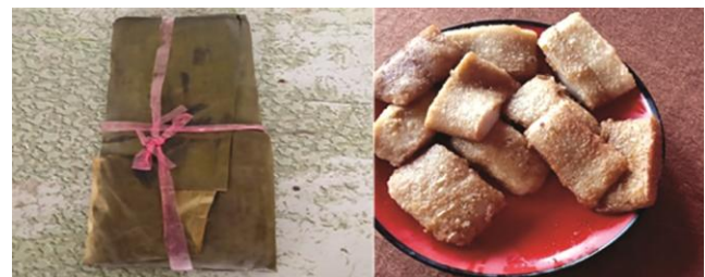
Fig. 2 — Chhangban

Pusla is a traditional snack of the Khasi and Jaintia tribes of Meghalaya. It is prepared by using Mynri rice, a local variety of rice. The rice is soaked in water