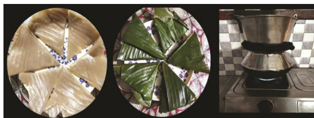
Fig. 4 — Winsii

This rice cake is mainly prepared by the tribe of Poumai Naga of Nagaland. The local name “ Kithou raokhao ” means sticky rice bread or pancake, and “ Kithou ” means sticky rice or glutinous rice. The sticky rice is soaked in water for 2-3 h. Then the water is drained and the rice is set aside. The