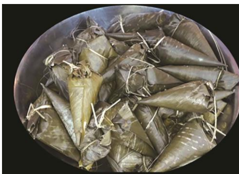
Fig. 8 — Awang Bangui