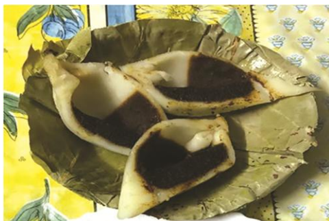
Fig. 9 — Yomari

combined with veggies, churpi, or meat to make a dish.