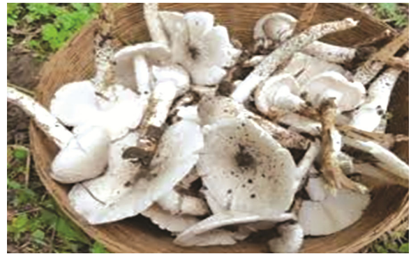
Plate 1 — Collected fresh Agaricus trisulphuratus species in the forest

Besides these, during the study 11 ranges were selected from the forest. Each range had approximately 200 families. A study of 2200 homes has been conducted to determine how many women are involved in the gathering of mushrooms to boost local economies. The amount of money made from the sale of various types of mushrooms and their contribution to overall earnings could not be calculated. The most likely causes include lack of suitable markets, inadequate transportation options, insufficiently high sale prices, and middlemen's