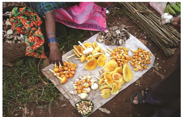
Plate 2 — Tribal women selling mushrooms in Achanakmar Village haat