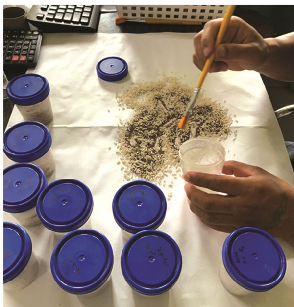
Fig. 2 — Plant powder mixed with rice grain

The growth inhibition in percentage was calculated using the formula given by Tapondjou et al. (2002) 13 :