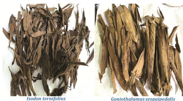
Fig. 1 — Two ethnobotanically important plants used for storage pest management in Manipur

Goniothalamus sesquipedalis and Isodon ternifolius , as shown in Figure 1, are two ethnobotanically important plants used by the farmers in Manipur by burning and smoking in traditional granaries to reduce pests and diseases incidence 8 . These plant components are combined with seeds, suspended in storage rooms, or incinerated to produce smoke prior to stocking a fresh harvest 9 . The Rongmei tribe of Manipur also uses the two plants together in multiple ways. The Rongmeis also drink a mixture of ashes (from the burnt leaves) with water to cure colic pain and stomachache in both children and adults. Konsam et al. (2015) also reported the use of G. sesquipedalis along with Isodon ternifolius in Manipur, one of the states of North-East India, in pre-and post-natal care as well as in traditional fumigation 10 . These plants have been extensively studied and are widely recognized for their usage in the traditional medicine and cultural practices of Northeast Indian communities.