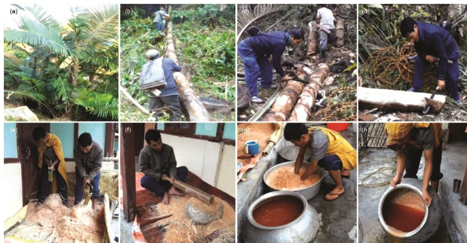
Fig. 1 — (a) Cyathea gigantea (tashe) fern, (b) cutting and cleaning of the fern, (c) cutting into small blocks, (d) peeling of hard bark, (e) & (f) pounding of fern blocks, (g) washing and allowing to settle, (h) draining of the water to obtain the tashe

Colour was determined using colorimeter (Hunter Lab). The colorimeter was calibrated with a standard white ceramic plate before use. The colour of tashe flour is measured using the Hunter L*, a*, b* scale where the degree of brightness to darkness is represented by the L* value, the degree of redness (+) to greenness (-) is