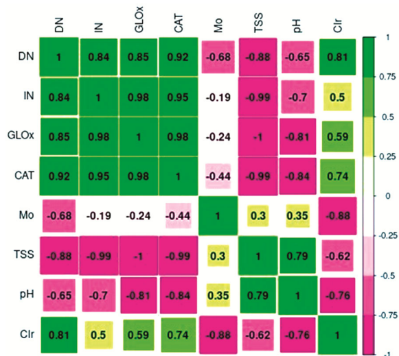
Fig. 1 — Heat map of Pearson's correlation matrix for raw honey samples.

*CD – Critical difference (p value<0.01) Mo – Moisture (%), TSS – Total soluble sugar (°Brix)