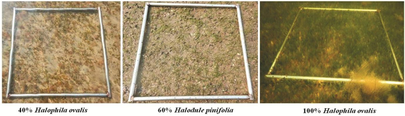
Fig. S2 — Seagrass density with varying % cover in quadrate assessment