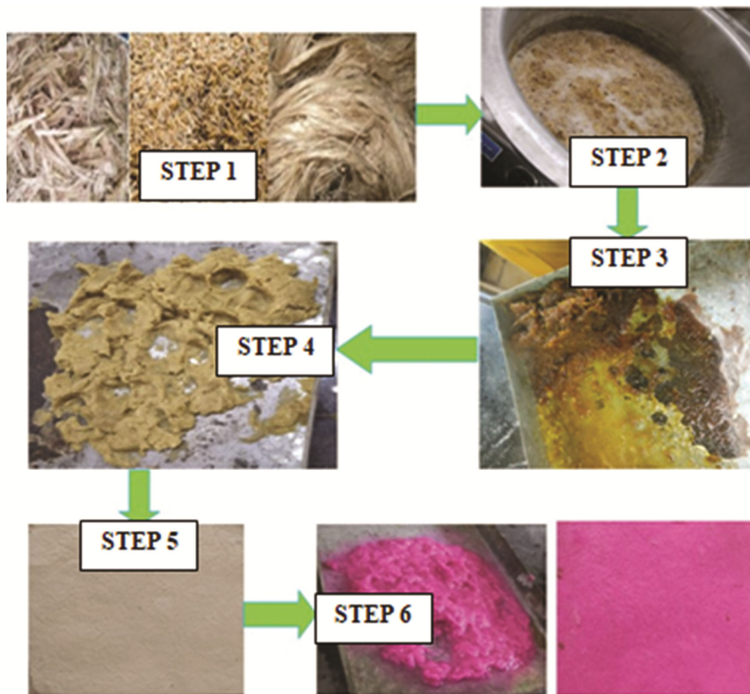
Fig. 1 — Experimentation of handmade craft paper sheet

Then, the materials were continuously washed with hot water followed by tap water.