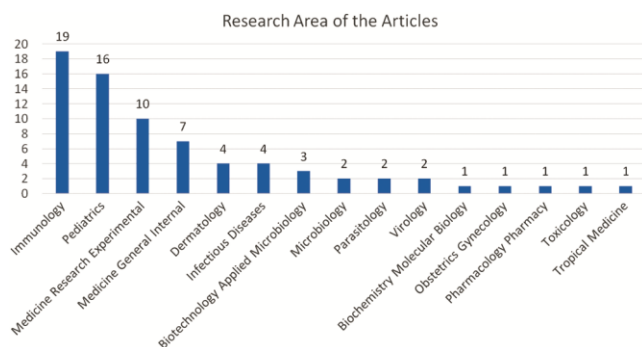
Fig. 3 — Articles published in journals and their publishers

freely accessible repository 55 . Bronze open access literature are freely available, but only on the publisher page, the journal articles are free to read, but cannot be redistributed or reused 56 .